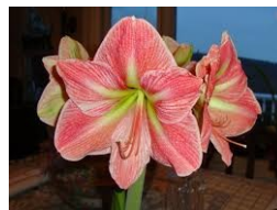
Terra Cotta Star

Bulbs must be ordered in October as supplier stock sells out!! RSVP with color choice and quantity of bulbs. Please place your order no later than Wednesday, October 14, 2015 with Barb Earnhardt at barb.earnhardt@yahoo.com or (330) 653-3831. Choose from these beautiful varieties: Terra Cotta Star, Aphrodite, White Nymph, Splash, Susan and Lemon Star.