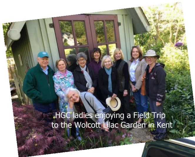
HGC ladies enjoying a Field Trip to the Wolcott Lilac Garden in Kent