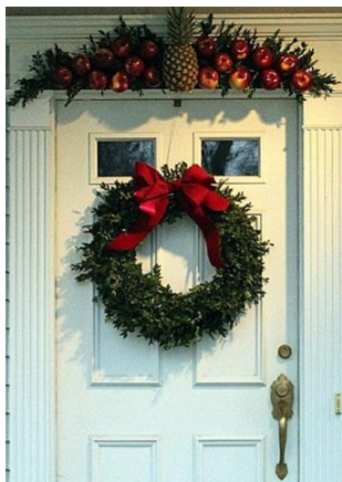
2011 Holiday Door Winner